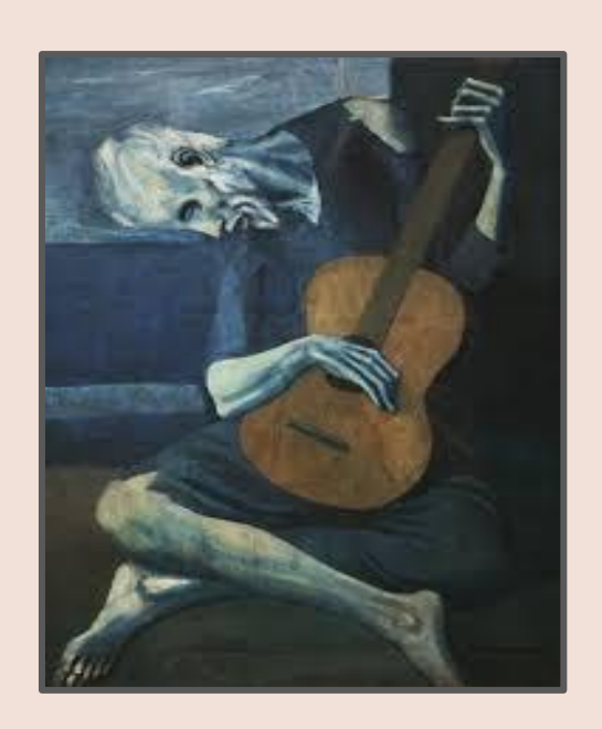
THE OLD GUITARIST