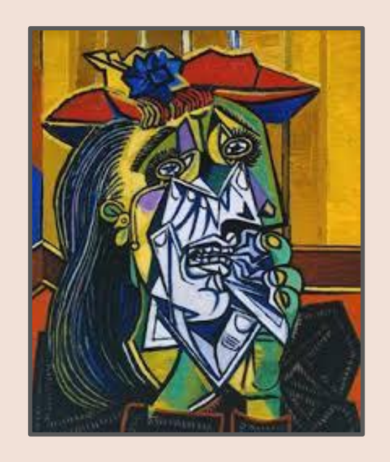
THE WEEPING WOMAN