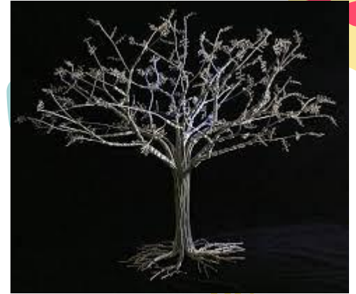
'Under the Tree' by Clyde Bango